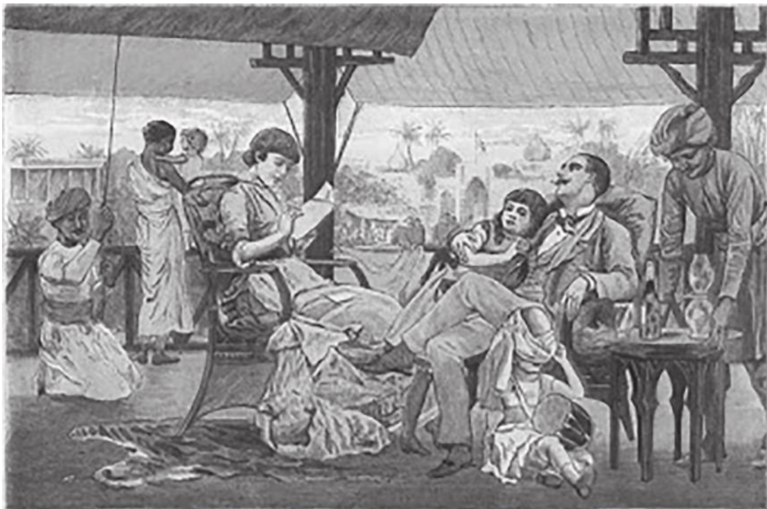
CHRISTMAS IN INDIA

A drawing of a British family living in India, published in a British magazine, 1881.