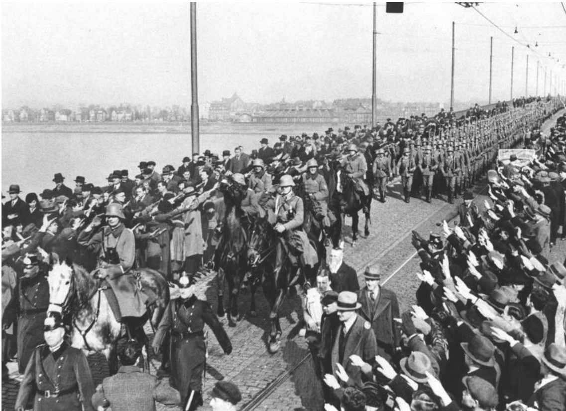
A photograph of German troops marching into the Rhineland, March 1936.